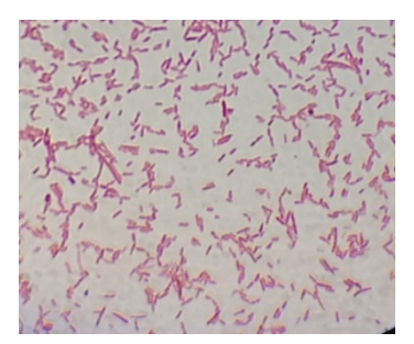
Figure 1. Escherichia coli rod-shaped morphology is red

colonies of 86.3 \times 10^{2} CFU/mL, while in alternative media the highest average is found in A1 treatment with an average of 36.6 \times 10^{2} CFU/mL